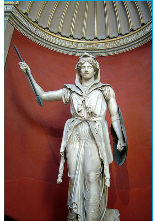
One possible namesake of the month of June is the Roman goddess Juno, depicted here in marble by an unknown sculptor, housed in the Vatican Museums.